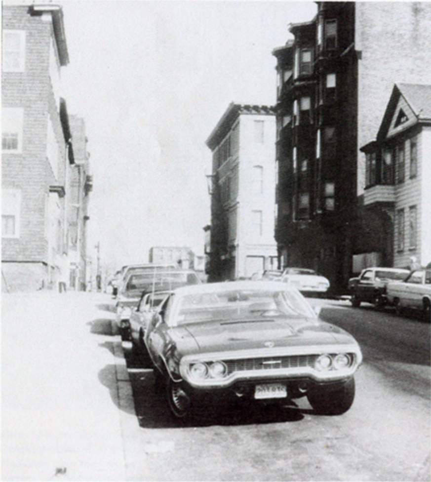
photograph of a street

EVERY TUESDAY THIS SEMESTER 09:30 / 12:30