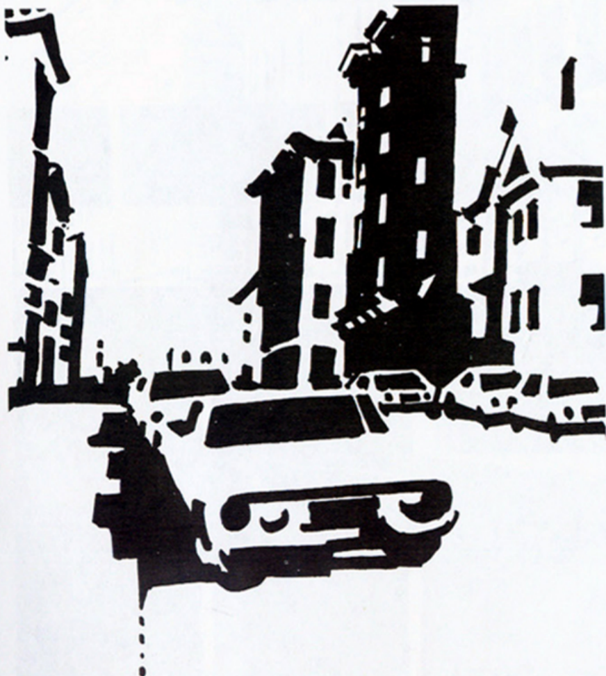
tone interpretation I (high contrast)