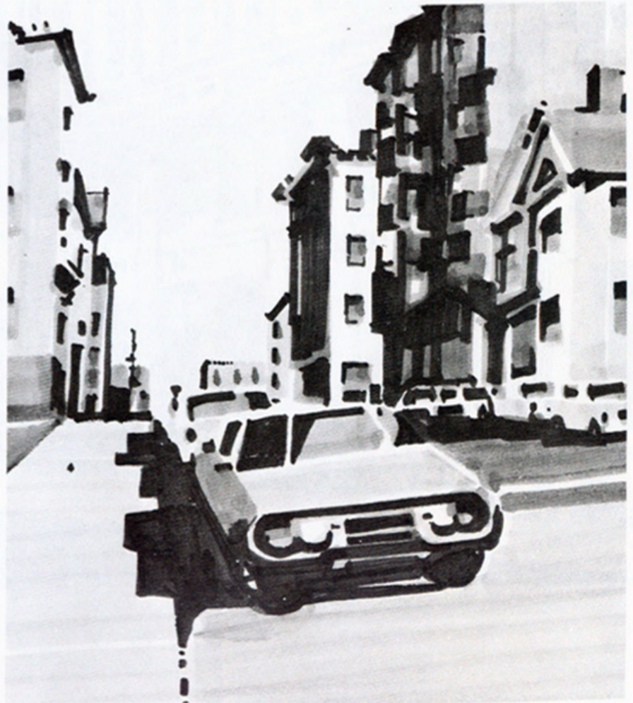
tone interpretation II (gray tones)